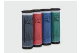
RISO INK FII Type Color (1000 ml)

The RISO i Quality mark indicates a RISO product compatible with the RISO i Quality System.