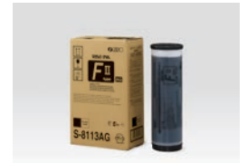
RISO INK FII Type Black (1000 ml)