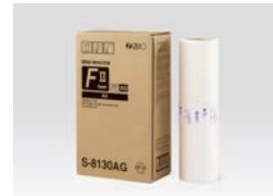
RISO MASTER FII Type (A3: 220 sheets)